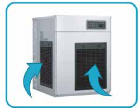
Front & Left In / Rear Out Air Flow

IBT-2230B: 4" (2) Bin top adapters to center mount 22" Head on IB-033/044