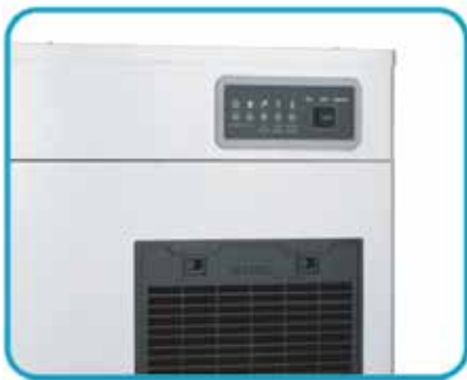
Easy to check and control by the front display

For more information, visit to www.icetroamerica.com/registration