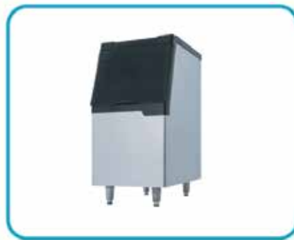
Storage Bin Option: