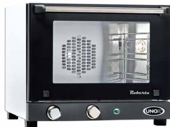
XAF 003 - Roberta