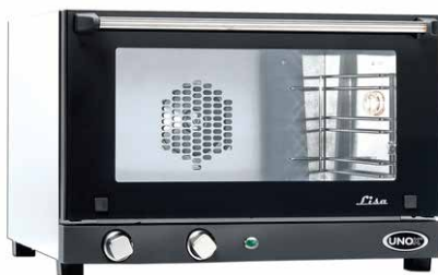
XAFT 013 - Lisa